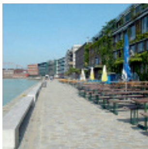
New leisure area at Münster's city harbour: the "Kreativ-Kai"