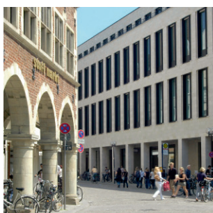
Cultural history meets modern present: Münster's arcades

Münster was the first German city to receive the LivCom Award. The Westphalian metropolis bridges the gap between traditional and contemporary in its own extraordinary way: Founded in 793, Münster has a long and illustrious history which still seems to echo through time in the mediaeval buildings of the historic old town which harmoniously contrast to the modern architecture seen in the city's new buildings. It is still possible to visit the gothic Hall of Peace where, after months of negotiation, the contracts ending the Thirty Years' War were signed. From there a walk along the famous Prinzipalmarkt with its magnificent gabled houses is a walk back to the time of the Hanse.