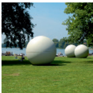
Experience culture, enjoy relaxation: local recreation at the Aasee

Münster's university was founded in 1780 and is one of the five largest universities in Germany. About 40.000 students study in more than 120 majors. The university's excellent reputation is particularly based on its law and business degree courses. The administration of the university is located in the Prince Bishop's Castle. This outstanding building was designed by the architect Johann Conrad Schlaun whose baroque architecture can be seen in many other parts of the city.